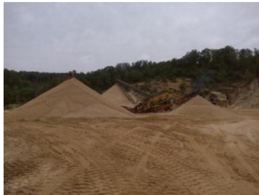
Southern Ohio Sand